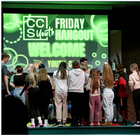
Friday Night Youth