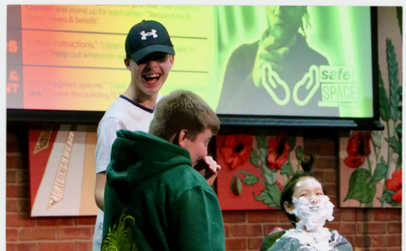
Shaving foam mess